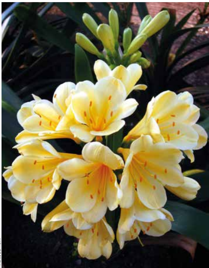
'Good' hybrids are expensive

For example, you can get fairly standard terracotta pots from Petersham nurseries for as little as £7.50. An artier pot