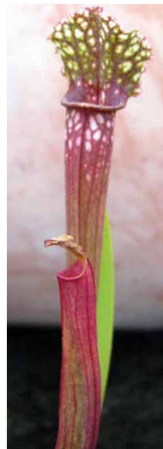
Specialties like carnivorous plants draw customers

She's widely regarded as something of a plant guru, and that means even more eager