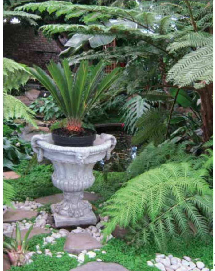
Displayed in a special setting this pot's value perception has been boosted

Display a single pot on a plinth and you'll fetch a higher price than if you have it packed among other pots. ▶